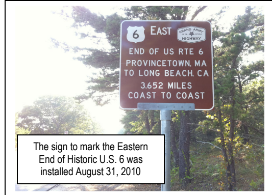
The sign to mark the Eastern End of Historic U.S. 6 was installed August 31, 2010