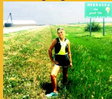
July 7, 2015, Gilbert pauses before crossing the border into Nebraska.